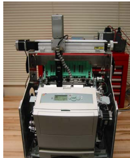
Figure 1: Drop-on-Drum Imaging System

A relationship was developed early on with contacts at Xerox in Wilsonville, Oregon. Xerox markets solid-ink printers and there is a considerable amount of testing required to produce various kinds of ink and ensure that the ink provides the correct color from the time it leaves the solid-state to the time it cools back into a solid on the paper. The first senior design project was an electromechanical test device to allow ink designers to view ink droplets on the printer drum. The project involved creating a chassis to hold a Xerox printer, mounting a movable camera above the printer that could observe the ink droplets on the drum, and designing a control system to operate the camera and the drum.