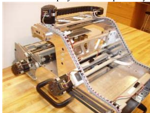
Figure 2: Ink Durability Tester

The successful completion of the first year project enabled further projects to be requested by engineers at Xerox. In the second year, Xerox commissioned the capstone design team to develop an "ink durability tester." As part of the ink development process, Xerox engineers desire to see how durable ink on paper is when it has been scratched. Xerox had a simple system to perform this test. To utilize the system, the tester would place a sheet of paper on a tray, set weights on some lever arms, and then press a button to have three metal nubs move across the paper with the desired weights. After moving the paper and performing the test a second time with three other weight selections, the paper could be taken up and moved to an evaluation stage. This process was very time consuming and Xerox wanted to automate the entire system.