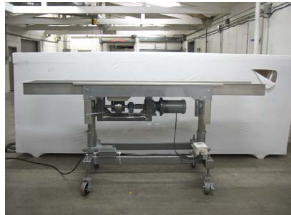
Figure 5: Horizontal Motion Conveyor

Prior to the start of the year, verbal agreements had been reached to perform test fixture design for a different company. The final agreement was pending approval from upper management. As Murphy's Law anticipates, the approval was denied shortly before the start of the school year. Fortunately, FMC Food Corporation had inquired asking about senior design opportunities. FMC builds horizontal motion conveyors to service the food industry. Unlike the other projects that had been completed, this company did not ask for a test fixture. Instead, they wanted engineers to contemplate a new way of performing horizontal motion – in essence, to brainstorm about a new way to perform one of the primary tasks of their company.