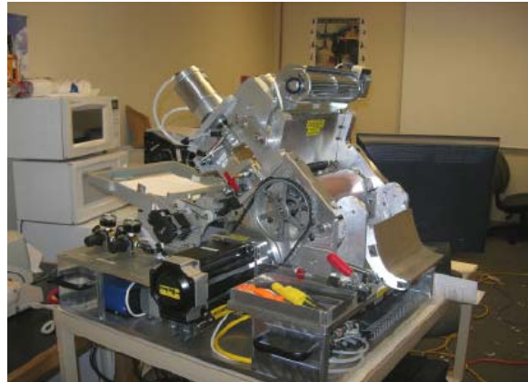
Figure 3: Transfix Roller Characterization

In a different part of the Xerox facility, engineers had heard of the work being done by the design team and requested another test fixture – one to test the qualities of the rubber rollers used in the printing process. This system involved a number of unique tests that had to be integrated into a single chassis with a number of different control systems – electronic, mechanical, and pneumatic. Xerox engineers desired a number of different speed, temperature, and pressure tests to evaluate the roller under different configurations. Design members did a significant amount of working scouring the market for various types of sensors and gauges to serve in the automation process. In this project, National Instruments hardware was purchased to control the various elements and LabView was used to control the system.